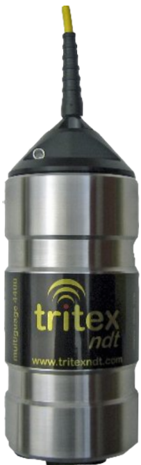
Multigauche 4400 4000 m